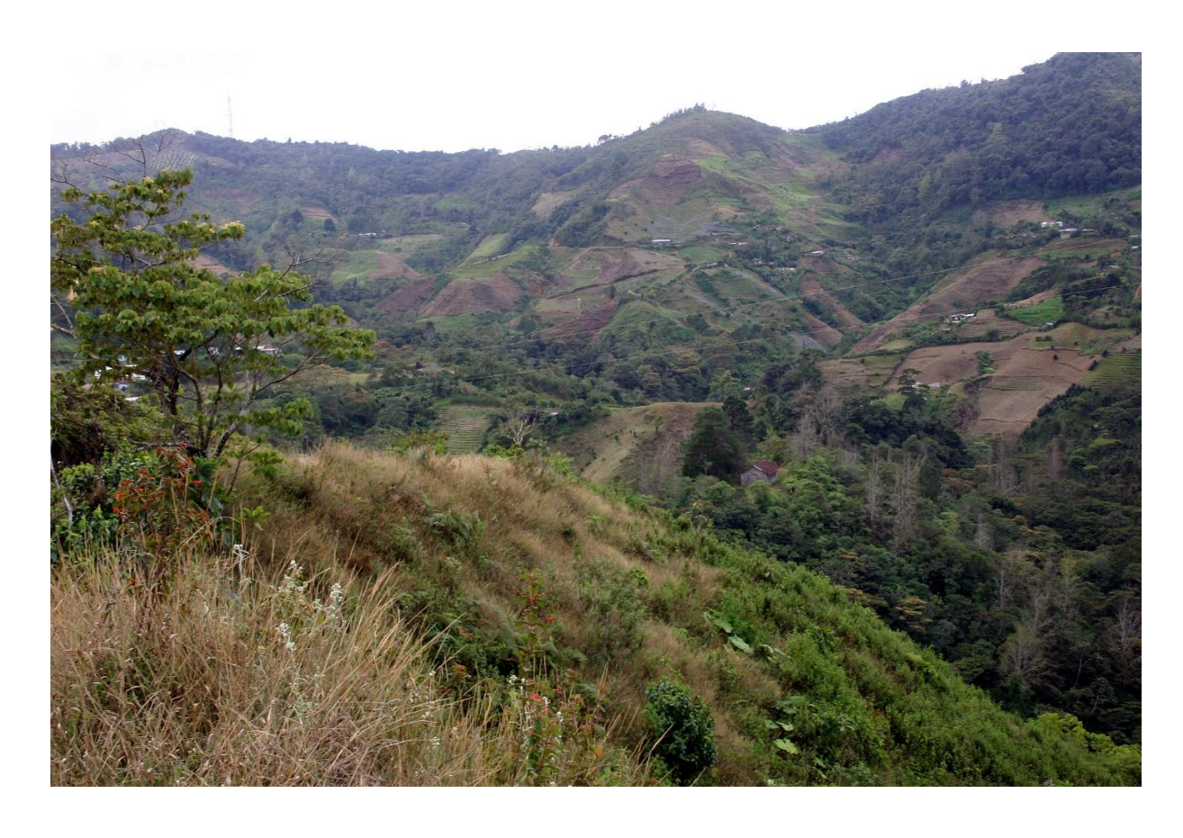
Merendón hills, near San Pedro Sula, Honduras