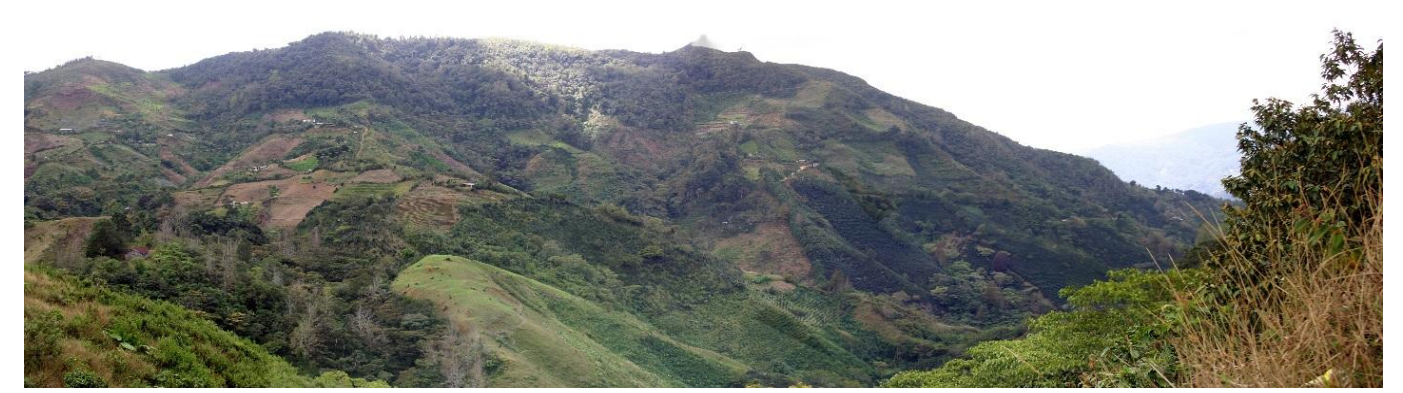
Effects of deforestation in the ZRM

Medical 'Brigade' visits in the ZRM during the 3-H Project