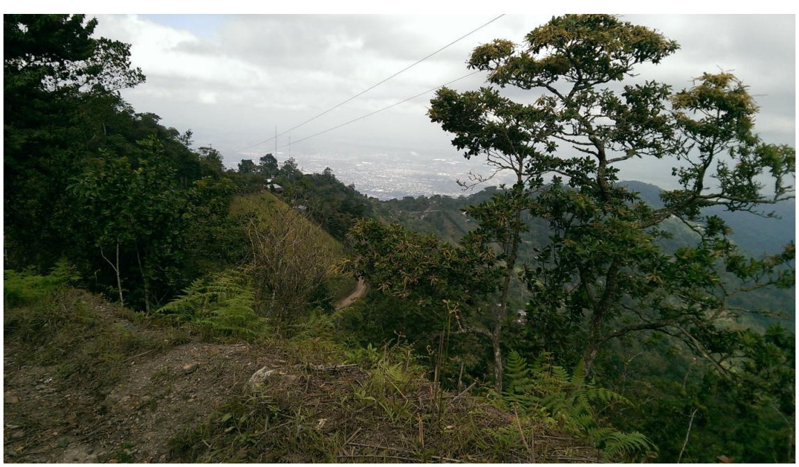
City of San Pedro Sula Viewed from the Merendón Hills