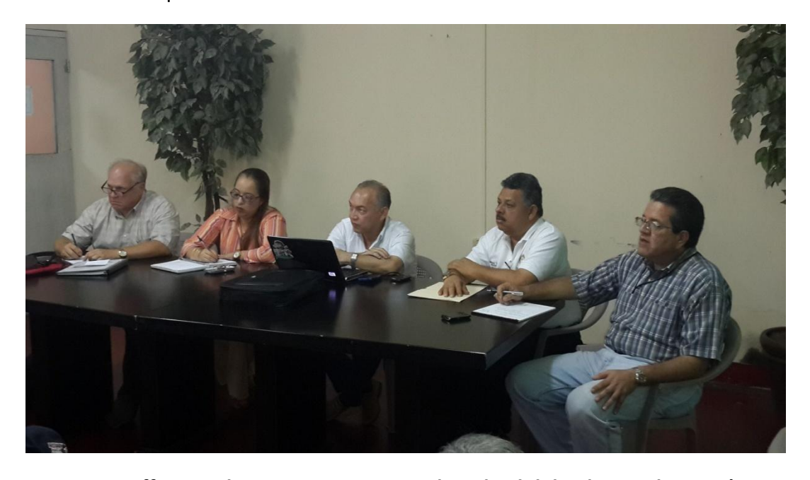
Meeting in DIMA offices with PPP Team, DIMA and Usula Club leaders and Mayor's Assistant

On Tuesday, 5 August, the team and Usula club leaders met with several other governmental and non-governmental organizations that work in the Merendón. The objectives were to learn about each organization's plans and activities, to see points of common interest, and areas of potential cooperation; as well as to assure that there would be no potential overlapping or repetition of activity, nor any potential points of conflict or interference depending on how the Usula club decided to proceed.