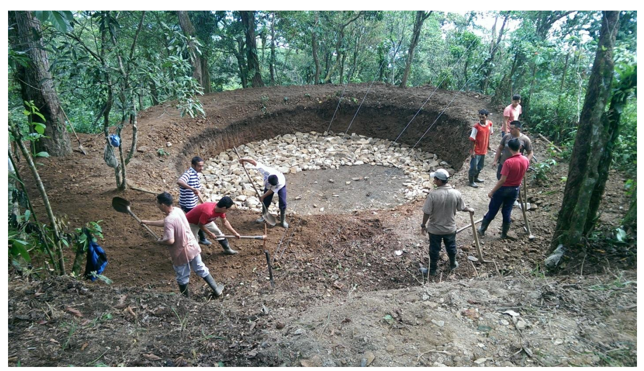
RC Usula GG Project Work in Progress on a Water Storage Tank in the Merendón

Other Usula RC projects in the ZRM include: construction of 100 latrines for the Corredor Peñitas-Gallito community, a kindergarten school for the Aldea La Virtud, a retention wall and sport field for the community of El Gallito, and a water filter project for 345 additional water filters.